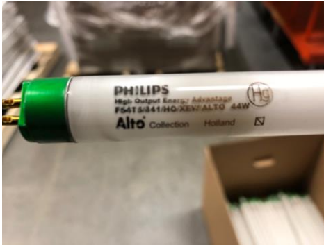
Close-up photo of the fluorescent T5 lamp