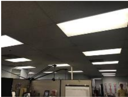
Main area 2x4 troffers